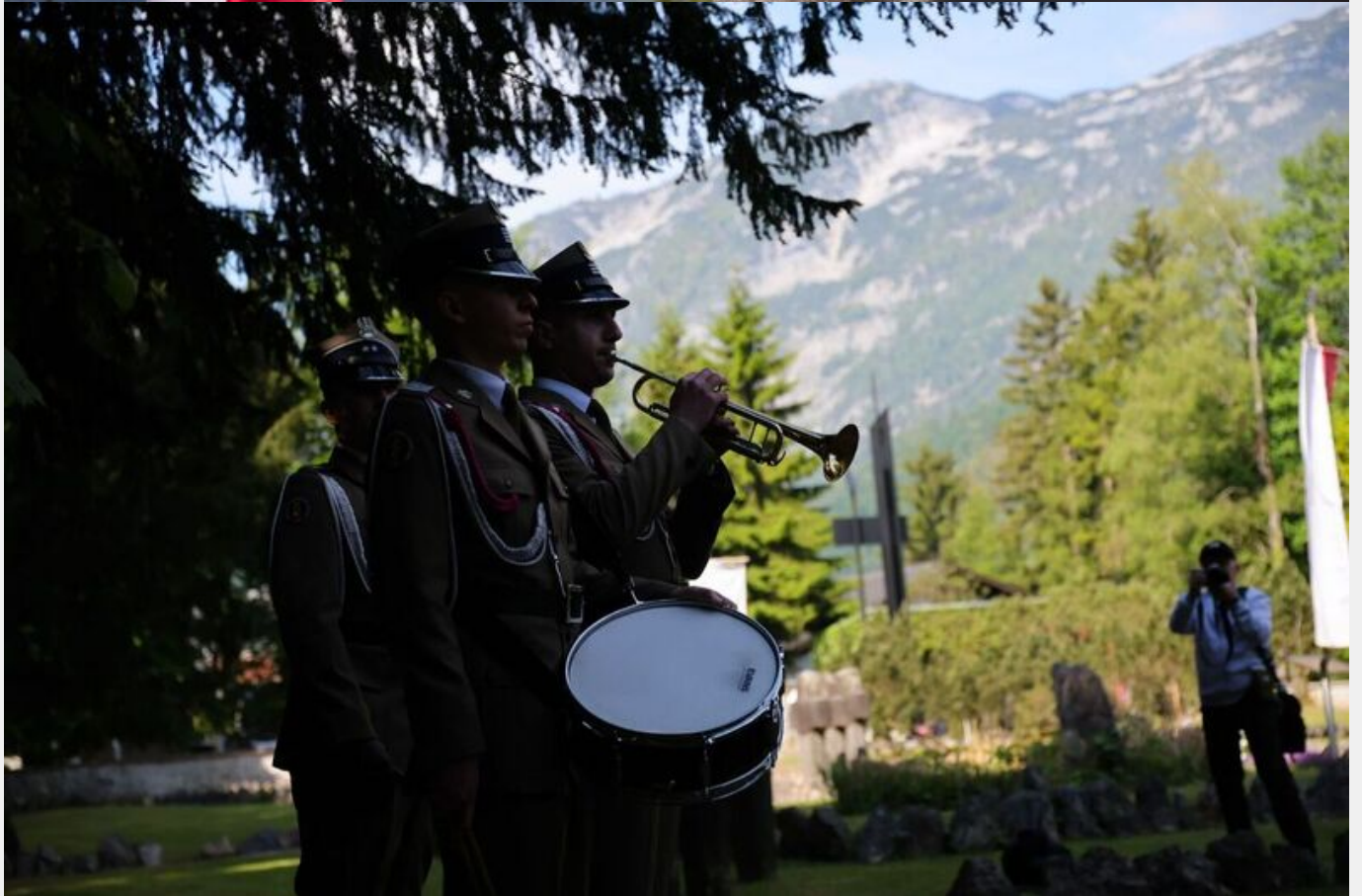
On 9 May 2026, a delegation from the Institute of National