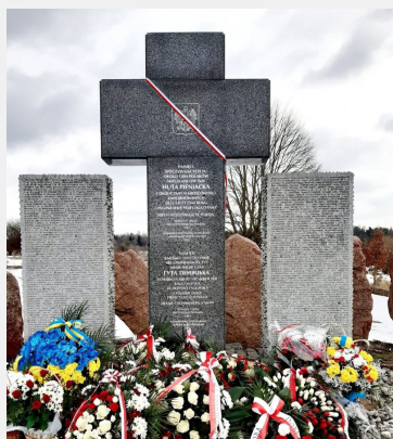
Cross at the Cemetery in Huta Pieniacka

According to estimates of the investigation carried out by the Institute of National Remembrance in Cracow, about 850 people were killed. Professor Grzegorz Motyka estimates that there were between 600 and 800 victims. The inscription on the monument in Huta Pieniacka informs about 1,000 killed Poles.